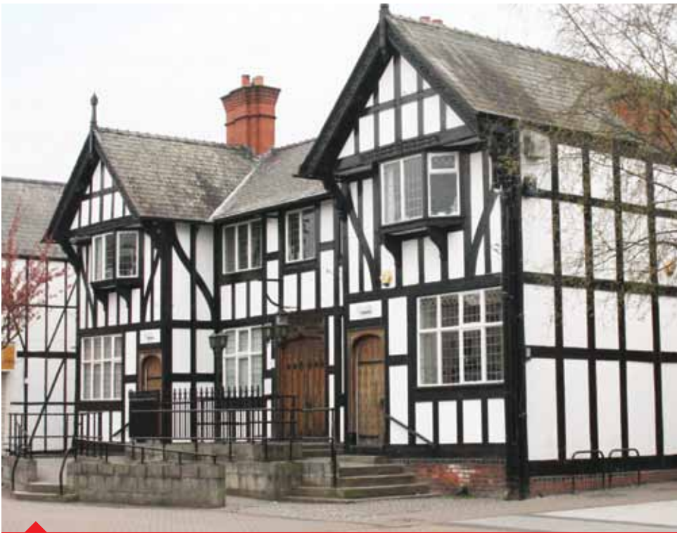
Northwich is one of Britain's prettiest small towns