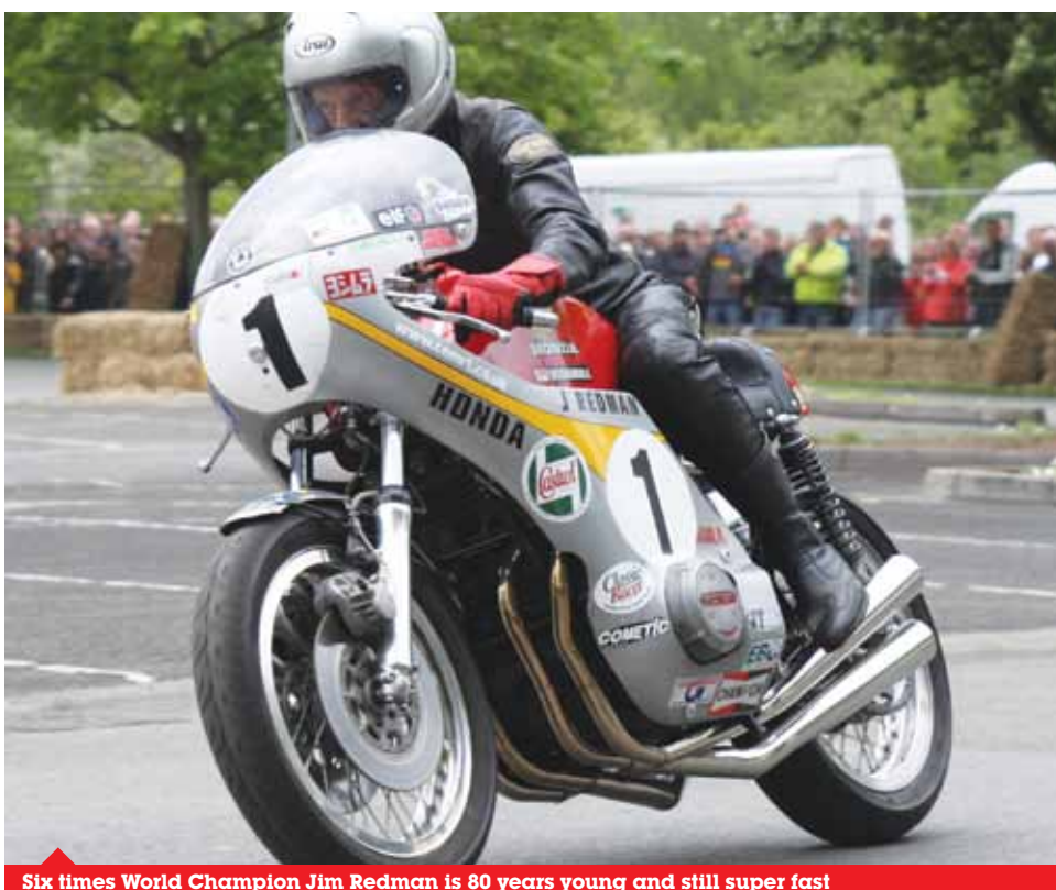
Six times World Champion Jim Redman is 80 years young and still super fast

Bennetts' representation will be extensive throughout the Thundersprint so make sure that you stop by and talk bikes with a company which truly shares your love of motorcycling.