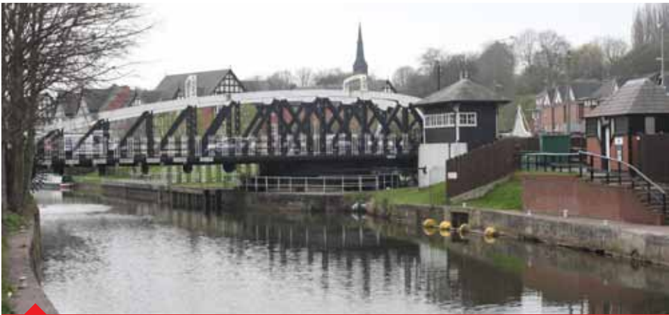
Northwich is framed by the elegant rivers Dane and Weaver