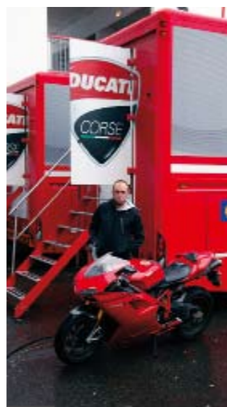
72 MAGNY COURS OR BUST ON AN 1198 AND ZX-10R