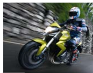
90 NAKED HONDA DELIGHT, THE 2008 CB1000R