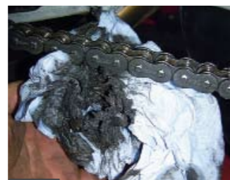
82 TECHNICAL TECHNIQUES TACKLED - Q&A SESSION