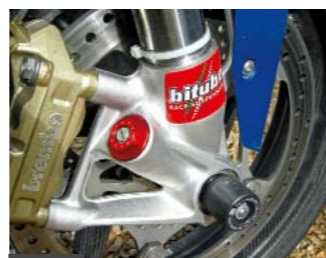
96 MODDER'S PARADISE: MORE FB FLEET NEWS