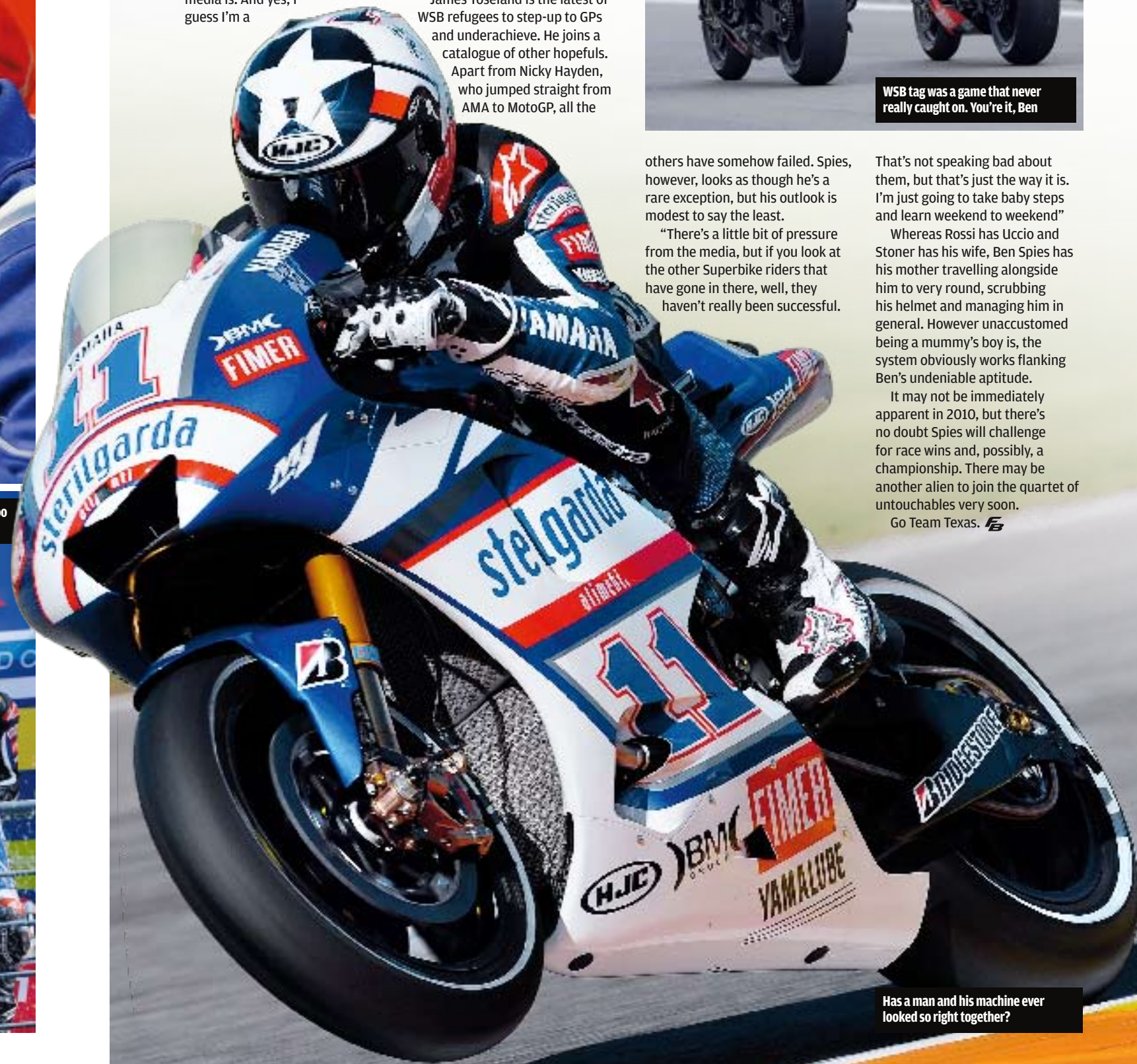
Has a man and his machine ever looked so right together?