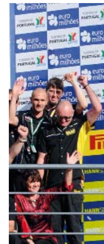
Hands up if you're super-stoked. Spies and his Yamaha homies celebrate in Portimao